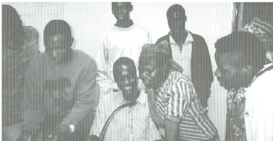
Radio Makuleke hits the air