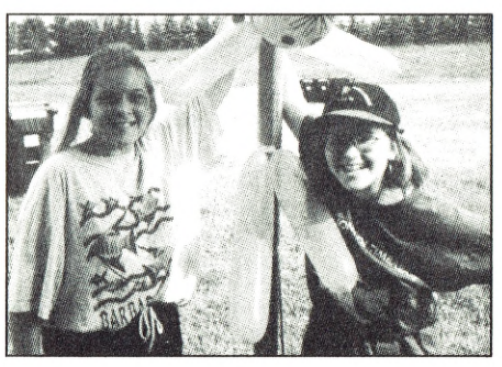
With their whole lives ahead of them, these girls look to the future with confidence and enthusiasm. Supporting the Women's Future Fund can help make sure their dreams come true.